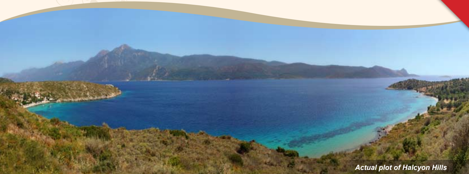
Actual plot of Halcyon Hills

150% BUYBACK GUARANTEE LIMITED AVAILABILITY